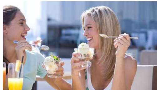
Residents Enjoying a Great Family/Fellowship Environment