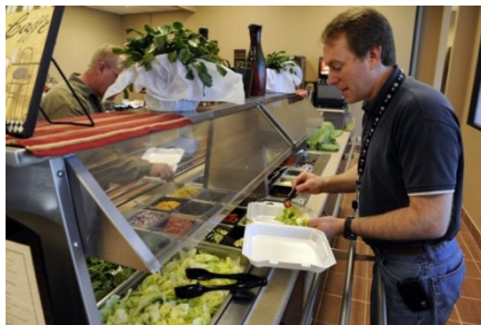
Separate Salad Bar, Dessert Bar & Beverage Stations