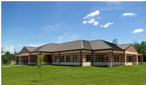
New Dining Facility (Rendering)

Design Build: $4,000,000 / Utilities & Infrastructure: $500,000 / Equipment & Furniture (Includes walk-in cold storage and refrigeration, cooking, food stations: $1,000,000 / Project Management & Contingency: $500,000 / Maintenance Endowment: $1,000,000